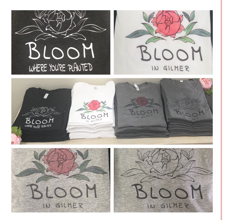
Shirts in a variety of sizes and colors