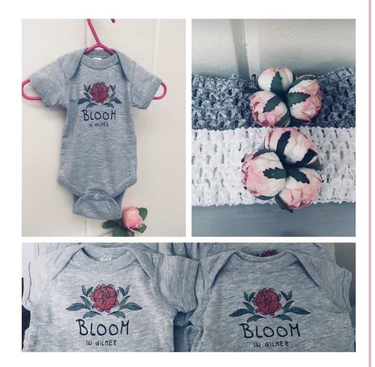
Onesies and Hair Bows

Hats, Tote Bags, Cups, Pillows, Notebooks